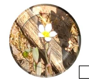
Fairy Flax (Linum catharticum)