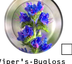
Viper's-Bugloss (Echium vulgare)