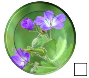
Soft Cranesbill (Geranium potentilloides)