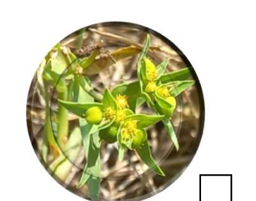
Dwarf Spurge (Euphorbia exiqua)