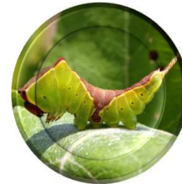
Puss Moth Caterpillar ( Cerura vinula )