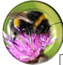
Buff-Tailed Bumblebee ( Bombus terrestris )