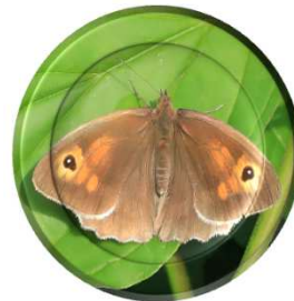
Meadow Brown ( Maniola jurtina )