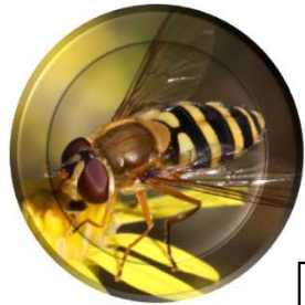
Hoverfly ( Syrphus ribesii )