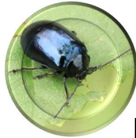
Alder Leaf Beetle ( Agelastica alni )