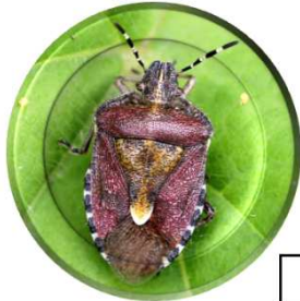
Hairy Shieldbug ( Dolycoris baccarum )