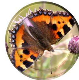
Small Tortoiseshell ( Aglais urticae )