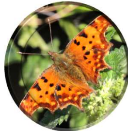
Comma ( Polygonia c-album )