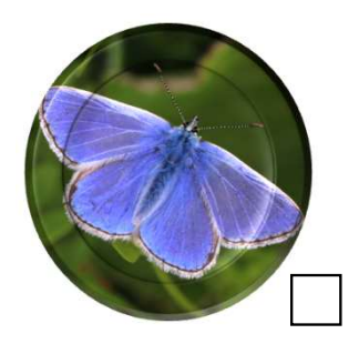
Common Blue ( Polyommatus icarus )